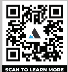
SCAN TO LEARN MORE