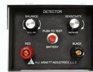
The Detector (Back)