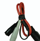
2-Wire AC Adapter