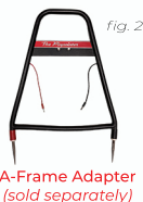
A-Frame Adapter (sold separately)