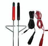
Probe & Cable Package