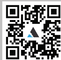
SCAN TO LEARN MORE

Built on a legacy of innovation and service as a trusted leader in accredited testing services and manufacturing of diagnostic testing equipment for 50+ years.