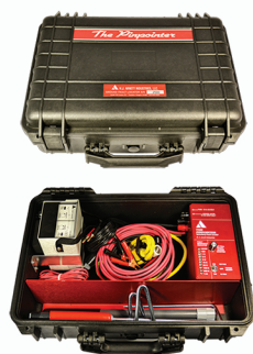
Rugged, Protective Hard Case