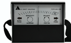
The Detector (Front)