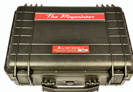
Tough, protective carrying case with secure locking latches