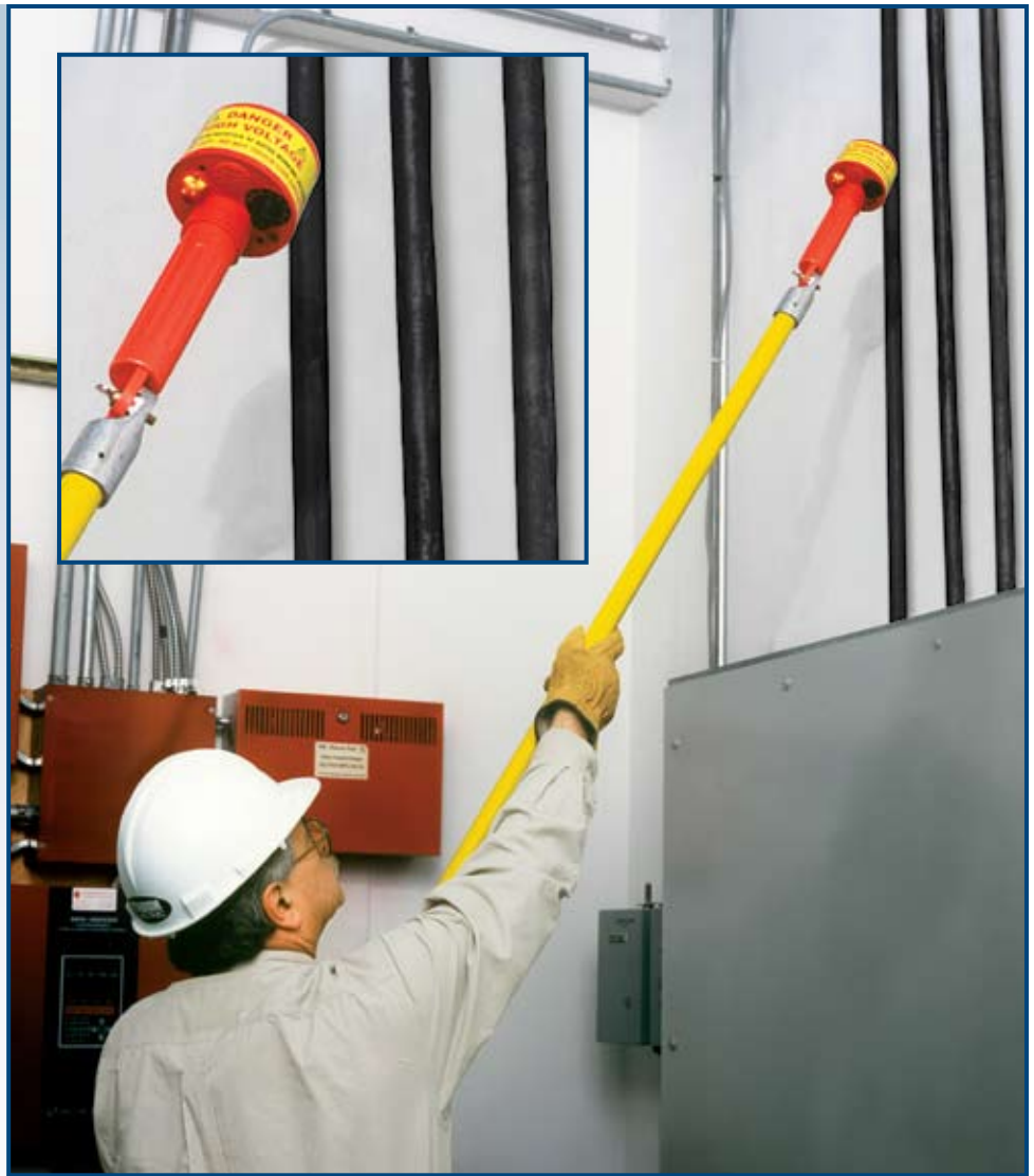
Model 275HVD checking for live voltage on main feeder

The Model 275HVD is powered by three standard Alkaline C cell batteries and can be used both in- and out-of-doors. A universal spline on the back-end facilitates attachment to any standard hot stick. A self-test position ensures that all circuitry and indicators are working properly before use.