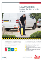
Leica UTILIFINDER+ Brochure

Illustrations, descriptions and technical data are not binding. All rights reserved. Printed in Switzerland – Copyright Leica Geosystems AG, Heerbrugg, Switzerland, 2015.