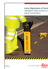
Leica Digicat xf-Series Brochure