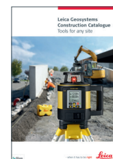
Construction Tools Catalogue