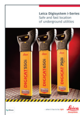
Leica Digicat i-Series Brochure